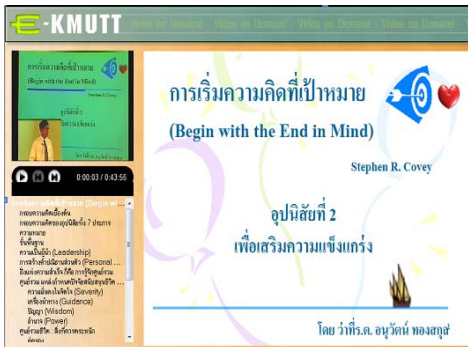
Figure 3 A WBT module with a trainer using a presentation (Jitgarun, 2007)

In the first phase, the authors developed a WBT module for enhancing knowledge of LO. It took one year (2007) to develop the WBT module. One page from the module is shown in Figure 3. The WBT module involved 12 lessons of theory and practice based on the five disciplines of Senge (1991) and the seven habits of Covey (1989). Each lesson focused on one of these. The module relied on the use of CDROM and video tapes. The trainer/instructor would be recorded in a room as shown in Figure 3. The module featured in nine different instructors and consisted of 12 lessons. Each lesson had the following components: (1) basic concepts; (2) definitions of terms; (3) principles and/or theories; and (4) trainees' activities which include examples and practice. For example, Covey's "Sharpen the Saw" focuses on practicing forces to achieve harmony to work effectively and efficiently. To achieve harmony requires a reduction of stress. Thus, one of the components of the practical part of that lesson involved going online and doing a stress test.